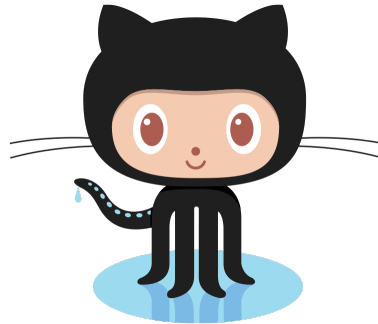
Figure 1. Github's mascot

Github's icon is a cat which is also an octopus: