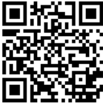
Figure 6. An example of QR code

We need an app on our phone to read QR codes, because this is how we will transfer our app onto our phone (fancy!).