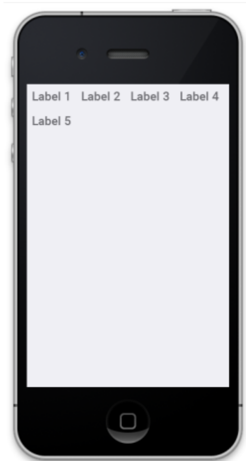
Figure 3. Previewing your app with the default layout

We see that by default, the Components are organized from left to right on the screen . When there is no more space on the line, the next Components is placed on the line below.