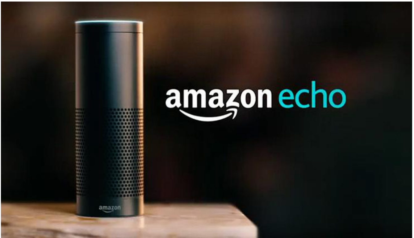
Figure 3. Echo Alexa, a home assistant collecting personal data