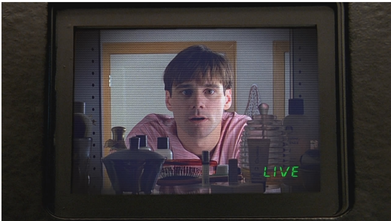
Figure 2. The Truman Show , 1998