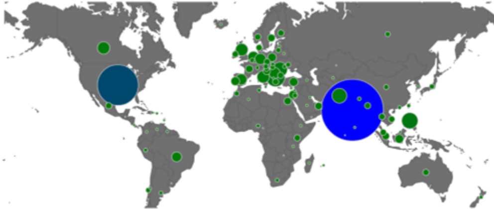
Figure 1: The number of workers per country. This map was generated based on geolocating the IP address of 4,983 workers in our study. Omitted are 60 workers who were located in more than one country during the study, and 238 workers who could not be geolocated. The size of the circles represents the number of workers from each country. The two largest are India (1,998 workers) and the United States (866). To calibrate the sizes: the Philippines has 142 workers, Egypt has 25, Russia has 10, and Sri Lanka has 4.

Yet, the geographical distribution of workers on Amazon Mechanical Turk is far from even. The following figure is taken from this study :