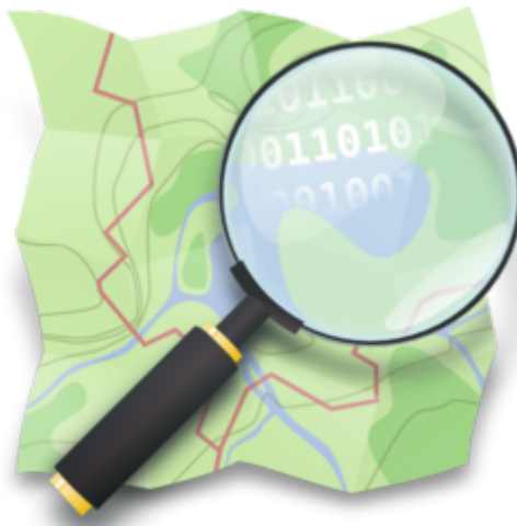
Figure 5. Openstreetmap