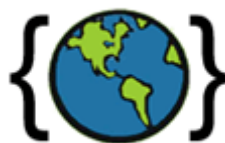
Figure 9. GeoJSON and TopoJSON are derivations of the json formats for geospatial data

"Select all streets in the Municipality of NYC where at least 2 of my friends are walking right now."